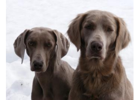
Keeper and Enzo