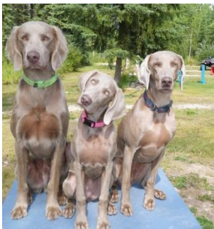
← Jake, Jazz and Keeper